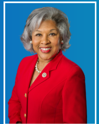
CONGRESSWOMAN JOYCE BEATTY

MANAGING PARTNER & CEO, ASLAND CAPITAL PARTNERS LLC