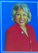
CONGRESSWOMAN JOYCE BEATTY U.S. REPRESENTATIVE, OHIO 3RD CONGRESSIONAL DISTRICT & CHAIR, CONGRESSIONAL BLACK CAUCUS (CBC)